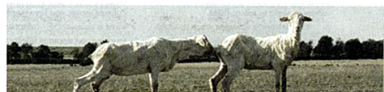
Nicola Loder, Sheep, the road to Maryborough (detail)

Nicola Loder's solo show wild thing appeared at Melbourne's Centre for Contemporary Photography April 10-May 10. Her work has featured in several local and international exhibitions including Telling Tales , the Child in Contemporary Photography at the Monash University Gallery in 2000, Strangely Familiar at the Australian Centre for Photography and Orbital at Lux Gallery London. She has also curated several shows, received project grants from Cinemedia/Experimenta and has lectured in media arts and photography at several Melbourne universities.